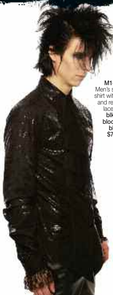
M14-013 Men's snap front shirt with foil print and removable lace jabot! blk/blk, blood/blk, black $79.95