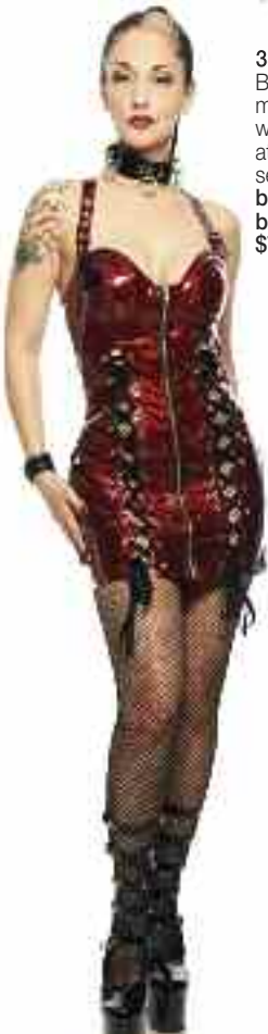
38-596 Buckle strap mini dress with lace up at princess seams! blk, blue, red $79.95