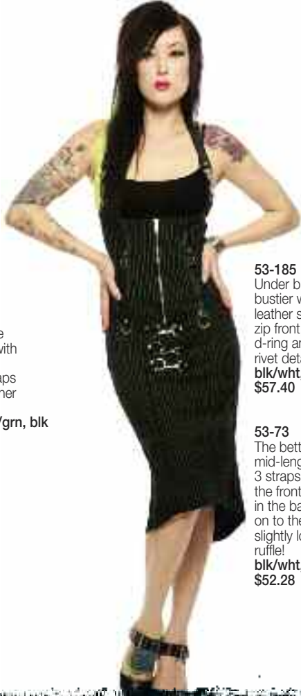
53-185 Under bust bustier with vegi leather straps, zip front, and d-ring and rivet details! blk/wht, blk/grn, blk $57.40