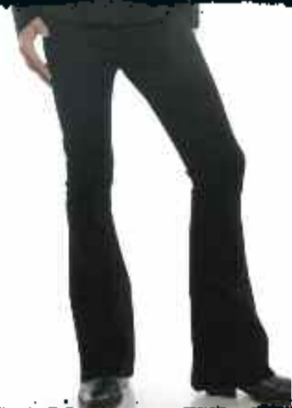
i) M63-002 12 oz Stretch Twill black