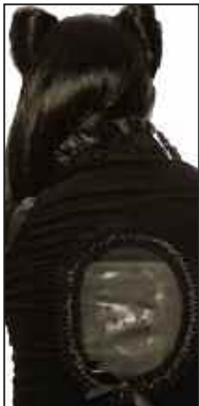
82-175 Burning Empires stretch velveteen jacket with high lace collar, and black skull foil print on matte vegi leather contrast at center back! blk/blk $112.75