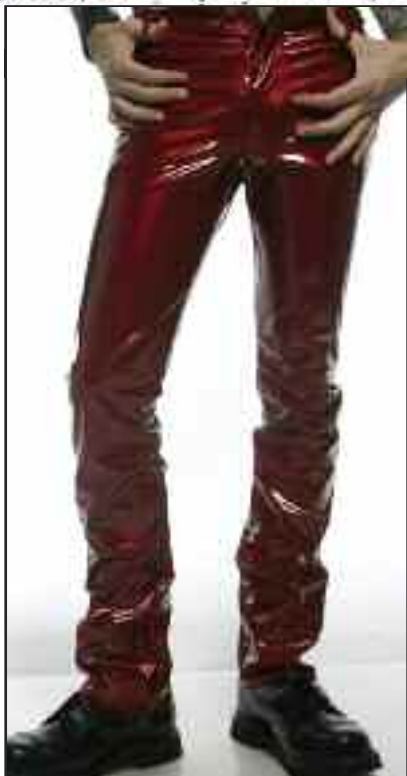
10-131-G New fit - These classic pants for guys are a loose fit vinyl "jean" with a button fly and 5 pockets for all yer sh*t!!! A perfect vinyl pant for your "starter" kit, 34" inseam! blk, blue, red $59.45