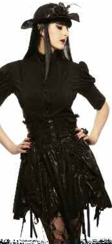
14-140 Under bust skirt with lace up sides and zip back! blk/blk, blood/blk, black $71.75