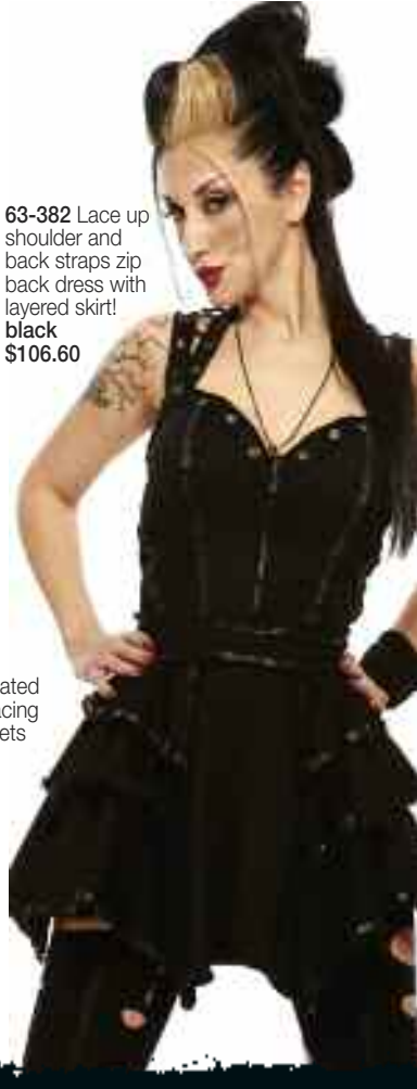
63-382 Lace up shoulder and back straps zip back dress with layered skirt! black $106.60