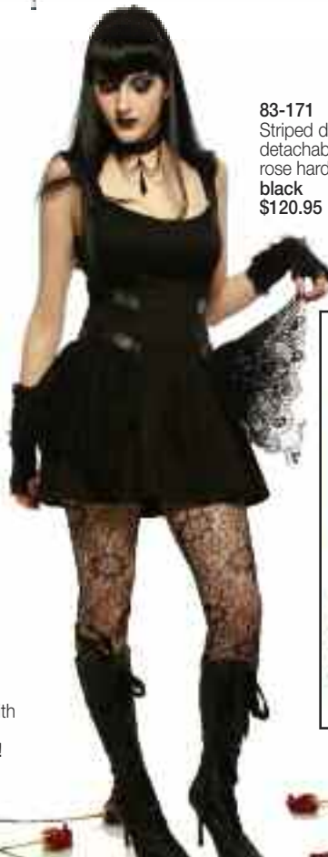
83-171 Striped dress with detachable lace layers and rose hardware details! black $120.95