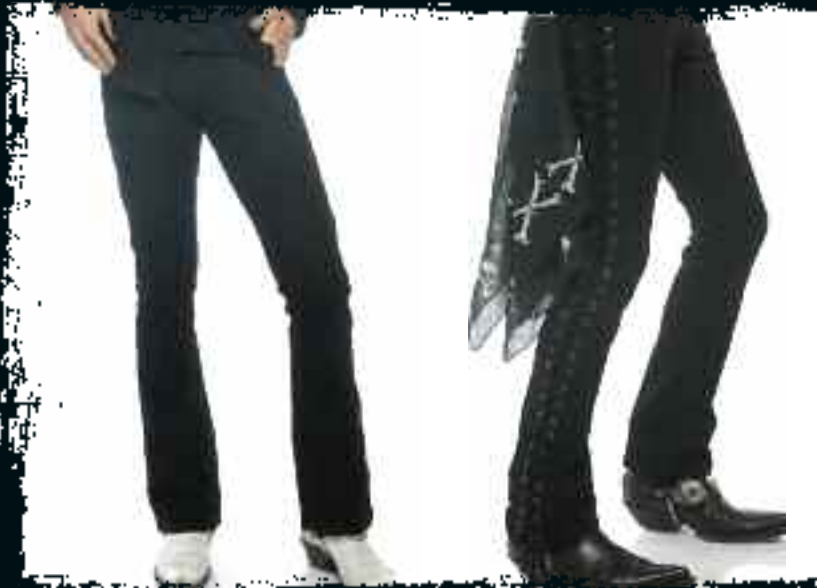
g) M63-004 12 oz Stretch Twill black