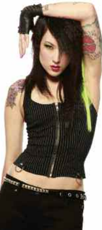
53-161 Carmen's lace up back bodice with vegi leather piping down front zip and back d-ring strap! Ba-zing! blk/wht, blk/grn, blk, gwt $51.25