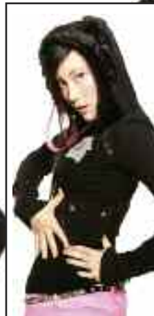
73-277 Broken Kitty hoodie with broken heart print, removable pockets, silver eyelet twill tape trim, and faux fur hood with kitty ears! black/pink $49.20