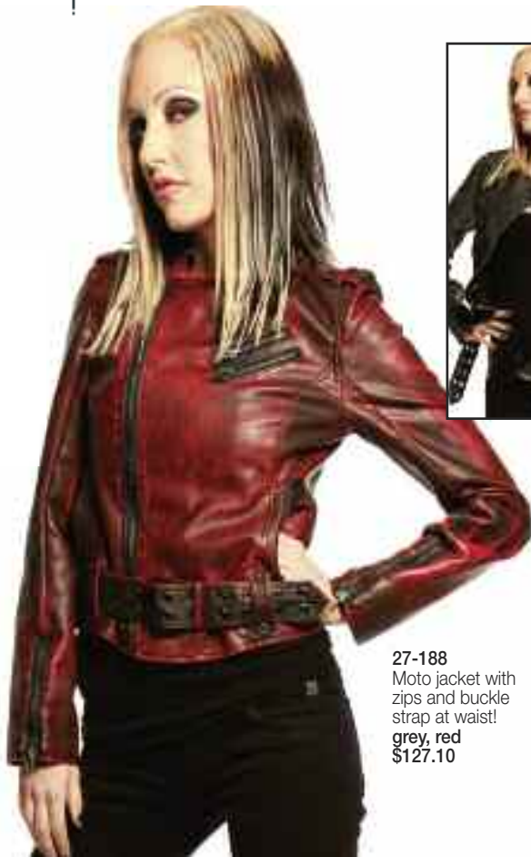
27-188 Moto jacket with zips and buckle strap at waist! grey, red $127.10

Pacing the Berlin streets... seedy living in New York City's beat... broken buildings in China's town... hiding out in London's underground... these moto jackets keep them looking, while you're lookin' good! Totally unique washed vinyl. All pieces are lined with custom dagger jacquard fabric.