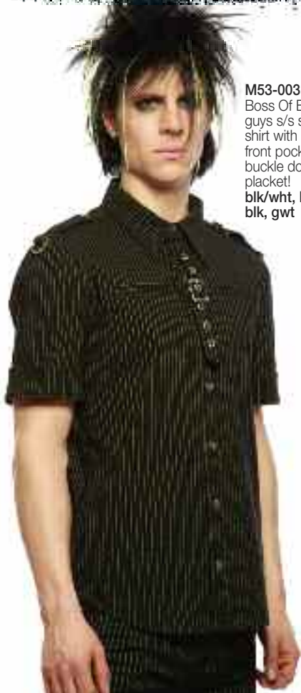
M53-003 Boss Of Bosses guys s/s snap up shirt with epaulets, front pockets, and buckle down front placket! blk/wht, blk/grn, blk, gwt $68.68