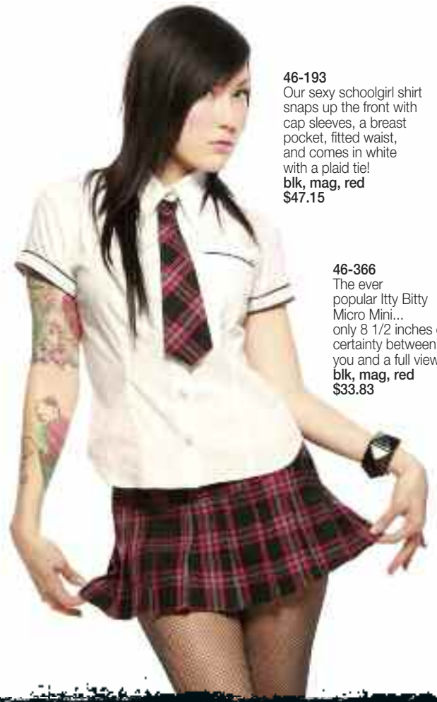
46-193 Our sexy schoolgirl shirt snaps up the front with cap sleeves, a breast pocket, fitted waist, and comes in white with a plaid tie! blk, mag, red $47.15