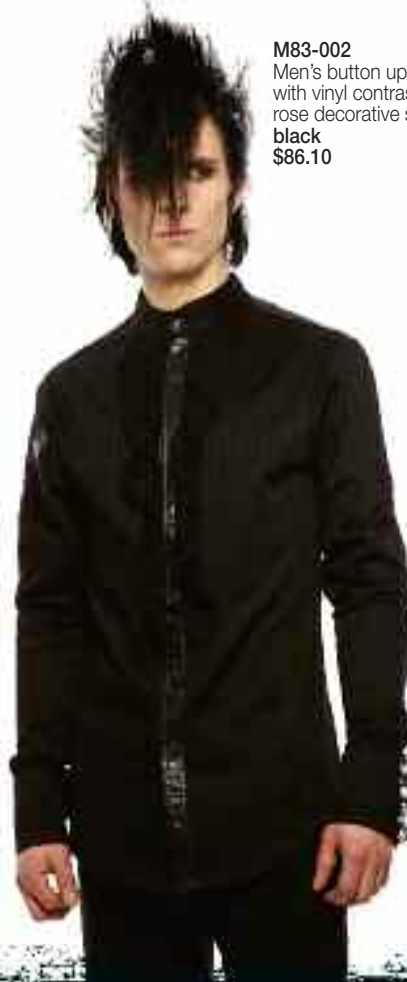
M83-002 Men's button up shirt with vinyl contrast and rose decorative snaps! black $86.10