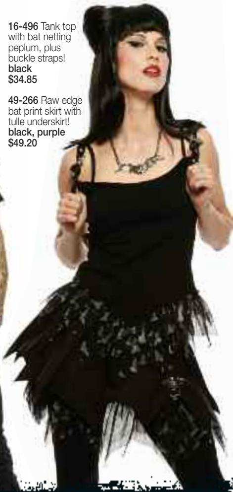
49-266 Raw edge bat print skirt with tulle underskirt! black, purple $49.20