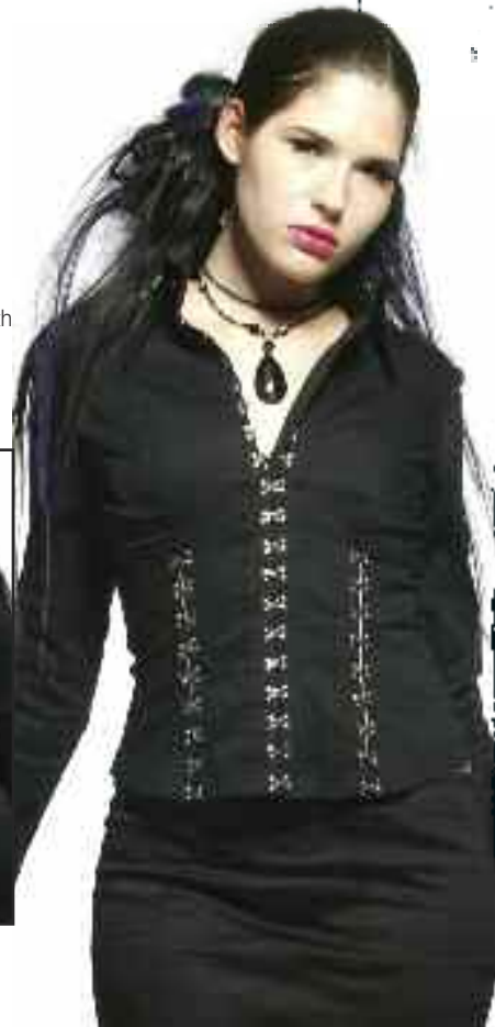
49-260 Hooked On Blacklist long sleeve stretch poplin shirt with hook and eye front, princess seams, and entire back! black $79.95