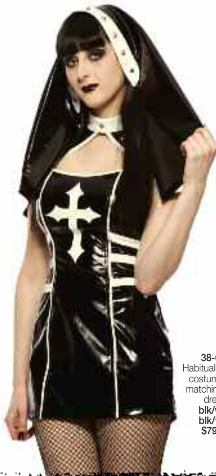
38-606 Habitualized nun costume with matching head dress! blk/wht, blk/vblk $79.95