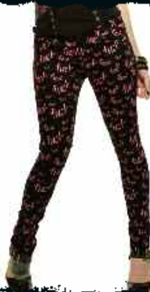
q) 28-218 Fuck Print Stretch Twill black/pink, black/white