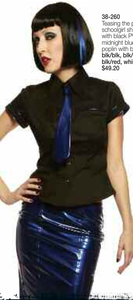
38-260 Teasing the professor - sexy schoolgirl shirt in black poplin with black PVC, red PVC, or midnight blue PVC tie, or white poplin with black PVC tie! blk/blk, blk/blue, blk/red, white/blk $49.20