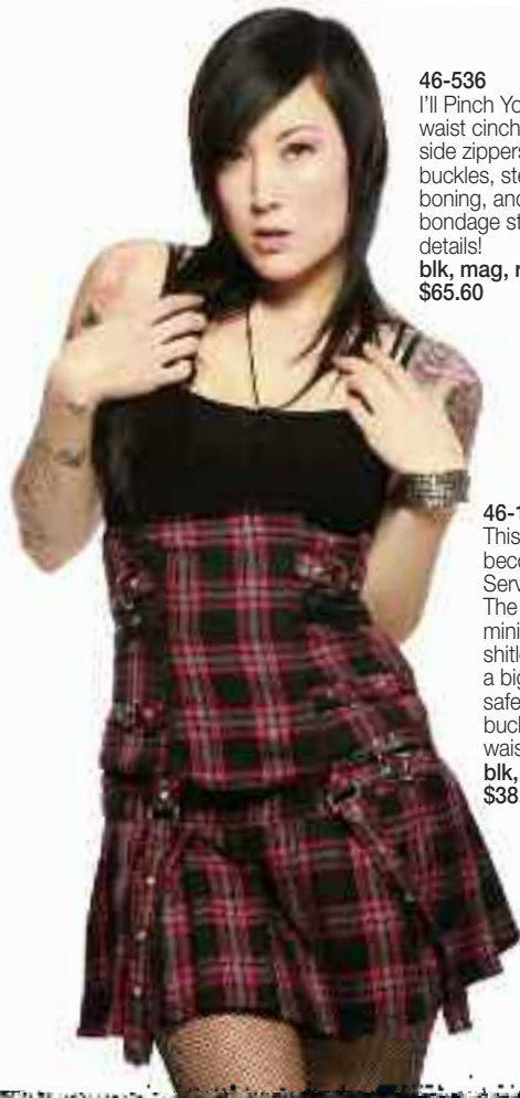
46-536 I'll Pinch You waist cincher with side zippers and buckles, steel boning, and bondage strap details! blk, mag, red $65.60