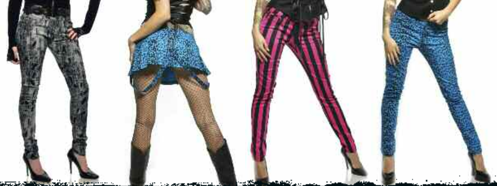
s) 28-219 Stockings Print Stretch Twill black/grey, black/purple