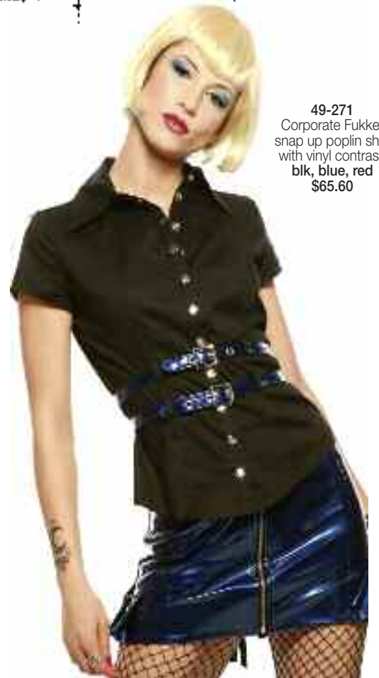
49-271 Corporate Fukker snap up poplin shirt with vinyl contrast! blk, blue, red $65.60