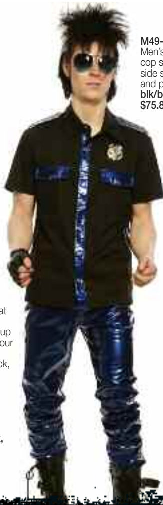
M49-020 Men's stretch poplin s/s cop shirt with PVC epaulets, side stripes, front placket, and pockets! blk/blue, blk/wht $75.85