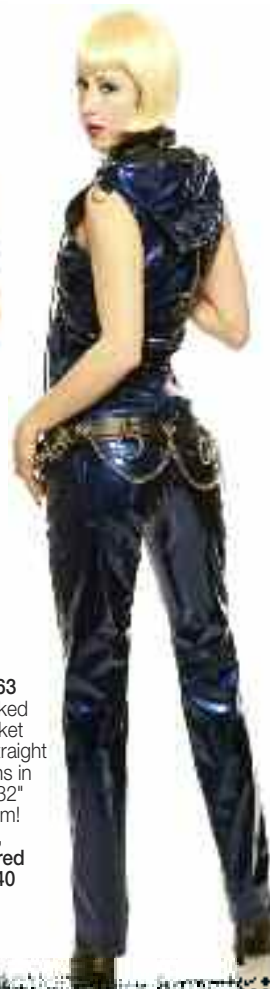
38-463 Reworked 5-pocket hipster straight leg jeans in PVC, 32" inseam! blk, blue, red $57.40