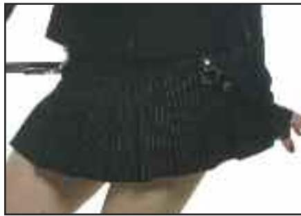
53-157 Married to the mob mini skirt with bondage straps and d-rings! blk/wht, blk/grn, blk, gwt $49.20