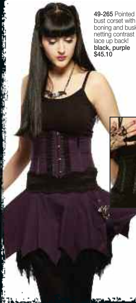
49-265 Pointed under bust corset with steel boning and busk, plus netting contrast and lace up back! black, purple $45.10

Custom antique nickel buckles and silver bat print on some styles. Totally bats!