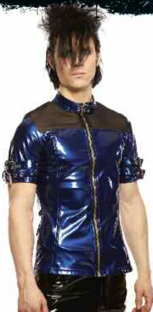
M38-006 Guys s/s zip up shirt with mesh contrast and buckle details at cuffs and collar! blk, blue $65.60