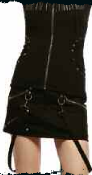
j) 63-401 10.5 oz Stretch Denim black