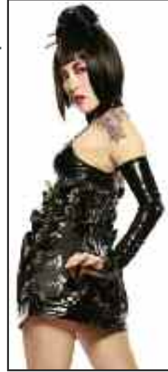
45-136 Sexy Ninja Training waist cincher with contrast vinyl straps, large eyelet details, and wide satin ribbon! red/blk, slvr/blk $86.10