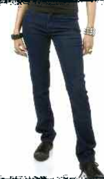
o) 64-365 Indigo Denim indigo