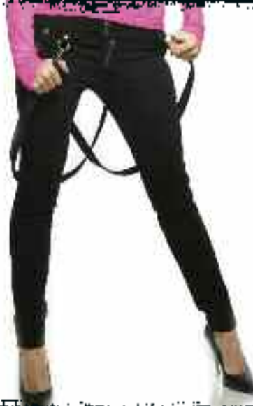
k) 63-321 10.5 oz Stretch Twill black