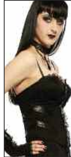
83-173 Gloves with rose snaps and lace trim! black $30.70