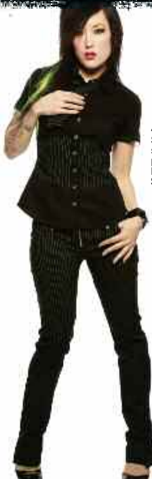
49-262 Stretch poplin s/s snap front top with pinstripe tie! blk/wht, blk/grn, blk $57.40