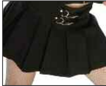
53-72 Slip her a mickey mini skirt is pleated all the way around with 2 slightly off-center straps and mondo clips at the waistband! blk, gwt, blk/wht $44.08