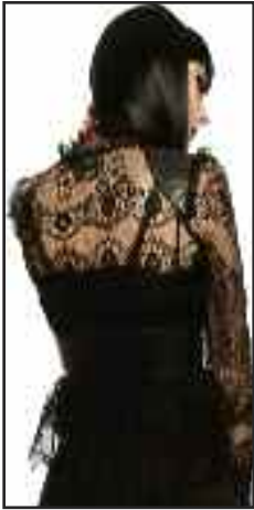
25-85 Long sleeve lace top with vinyl trim and rose snap detail! black $86.10