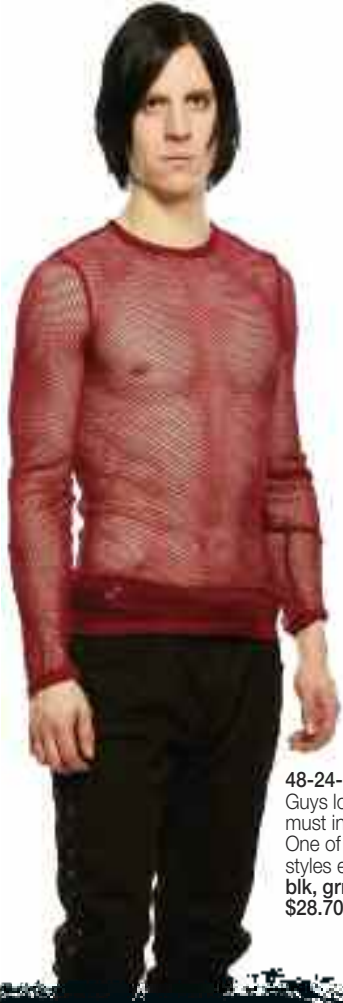
48-24-G Guys long sleever - a must in every wardrobe... One of the best fits and styles ever! blk, grn, wine $28.70