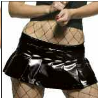
38-401 The ever popular itty bitty micro mini... Only 8 1/2 inches of certainty between you and a full view! blk, blue, red $34.85