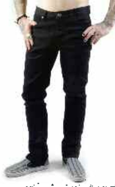
f) M63-080 12 oz Stretch Twill black