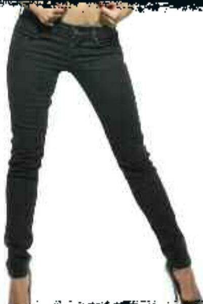
p) 64-392 Denim black