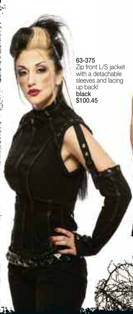
63-375 Zip front L/S jacket with a detachable sleeves and lacing up back! black $100.45

The future's uncertain, dress for the worst! More apocalyptic wear with Return of the Thunderdome. Leatherette appliques, black oxide grommets and lace accents and details. Why wait for a swarm of locusts - create your own apocalypse!