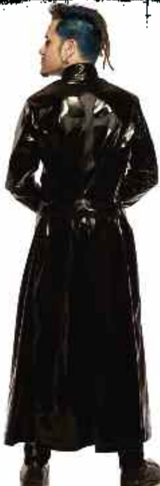
M38-012 Atonement men's priest cloak with snap front and cross contrast on back! blk/vblk, blk/wht $118.90