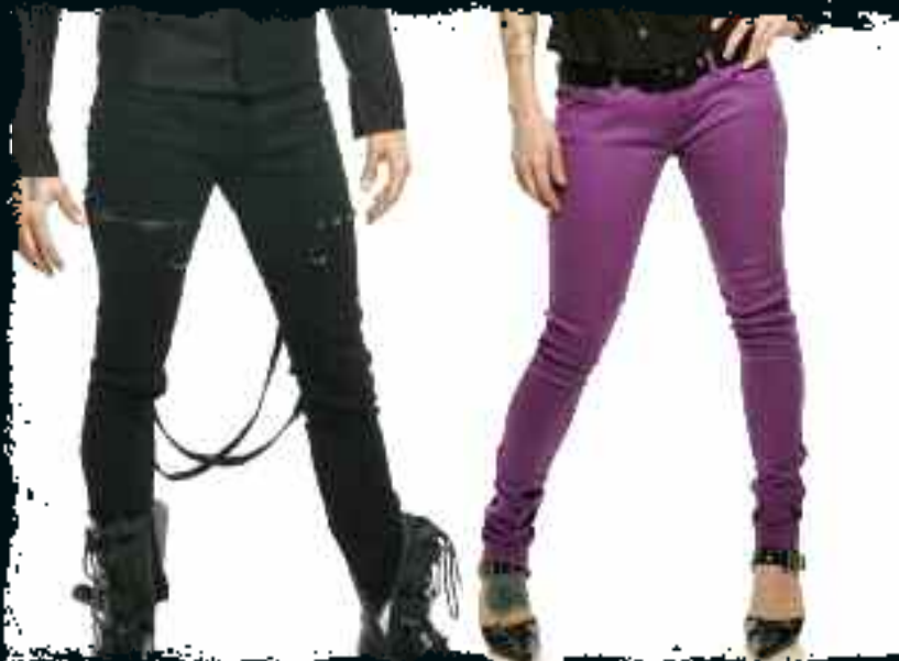
m) M63-003 12 oz Stretch Twill black