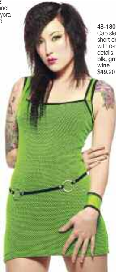
48-180 Cap sleeve short dress with o-ring details! blk, grn, wine $49.20