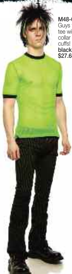
M48-002 Guys fishnet tee with lycra collar and cuffs! black $27.68