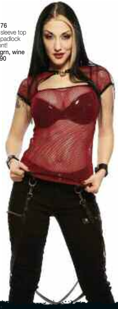
48-176 Cap sleeve top with padlock at front! blk, grn, wine $36.90