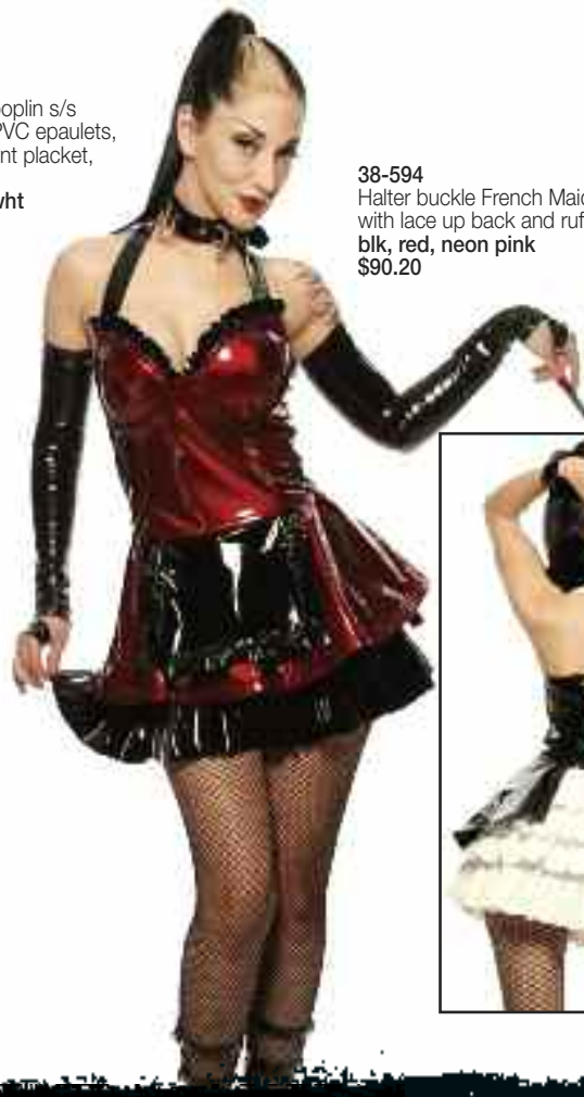
38-594 Halter buckle French Maid dress with lace up back and ruffle details! blk, red, neon pink $90.20