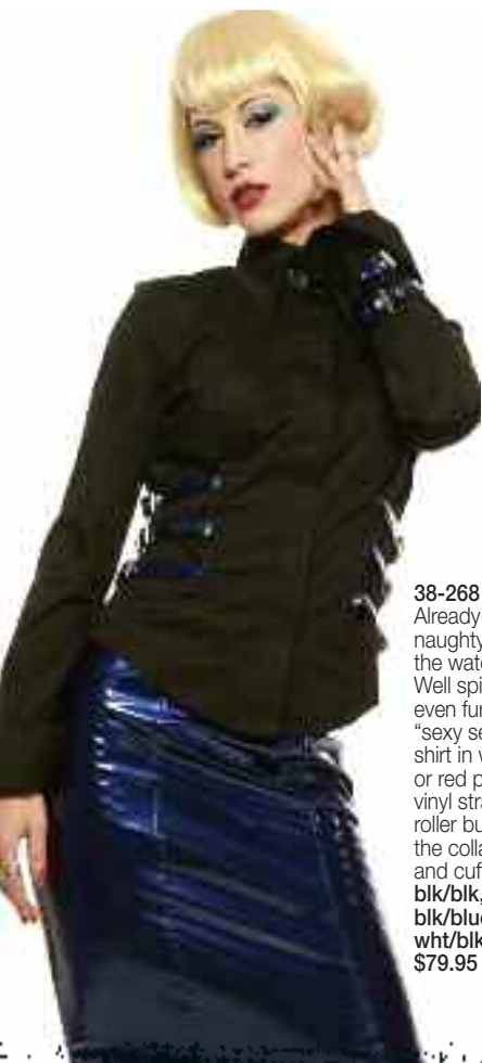
38-268 Already giving naughty glances at the water cooler? Well spice things up even further with our "sexy secretary" shirt in white, black, or red poplin with vinyl straps and roller buckles at the collar, waist, and cuffs! blk/blk, blk/red, blk/blue, red/blk, wht/blk $79.95