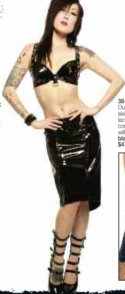
38-192 Our "tempting secretary" vinyl skirt is knee-length and has a lace up back and a super snug corset fit...shhh! Your husband will never find out! black, red, blue $47.15