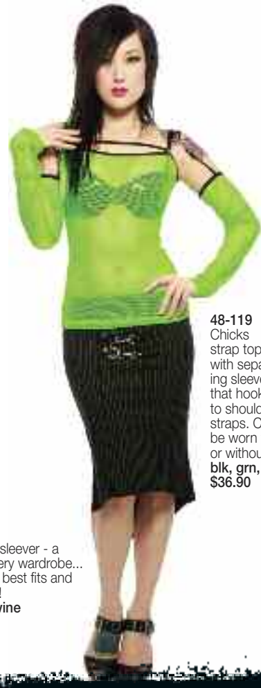
48-119 Chicks strap top with separat- ing sleeves that hook on to shoulder straps. Can be worn with or without! blk, grn, wine $36.90