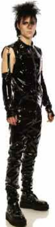
M38-011 Men's zip front shirt with detachable sleeves! blk, wine $90.20