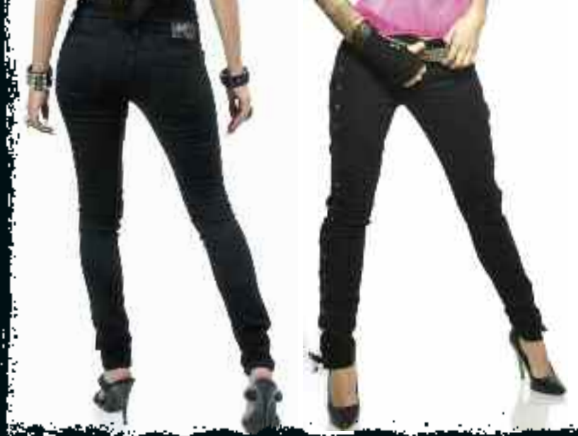
a) 63-356 10.5 oz Stretch Twill black