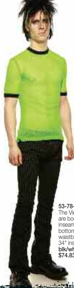
53-78-G The Vinnie Scaraducci pants for guys are boot cut with a hidden zipper in the inseam to open them even wider at the bottom! 4 pockets and a double snap waistband complete their gangsta look! 34" inseam! blk/wht, blk/grn, blk, gwt $74.83