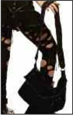
63-378 Unisex over the shoulder computer bag with pyramid studs and zipper detail! black $57.40