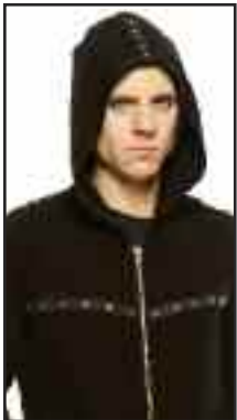
M16-328 I Stole Your Toy men's hoodie with silver eyelet twill tape and blue zig zag stitching! black $49.20