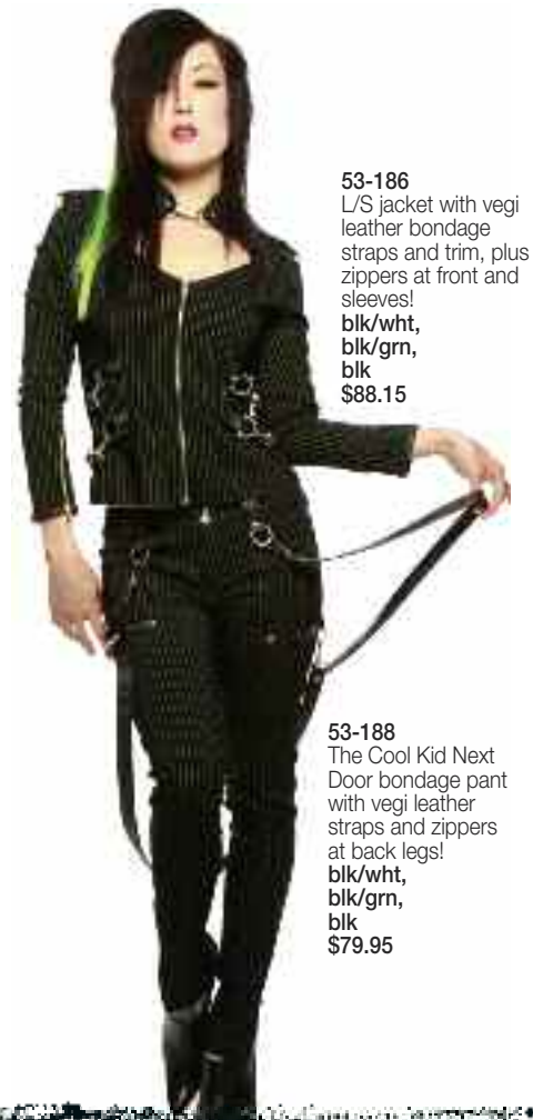
53-186 L/S jacket with vegi leather bondage straps and trim, plus zippers at front and sleeves! blk/wht, blk/grn, blk $88.15