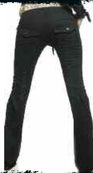
l) 63-345 Stretch Twill black