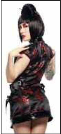
45-134 Dark And Sweet zip back mini skirt, eyelet trim, and black satin ties at sides! red/blk, slvr/blk $59.45