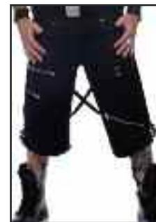
M46-021 Crusty Dave guy's bondage short with zips, straps and plenty of pocket room! blk, red $59.45