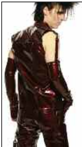
M38-013 Men's JUNKIE fit 5 pocket pant with removable side strap, plus d-ring and stud details! blk, wine $82.00