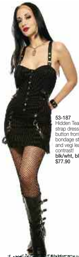
53-187 Hidden Tease strap dress with button front, bondage straps and vegi leather contrast! blk/wht, blk/grn, blk $77.90