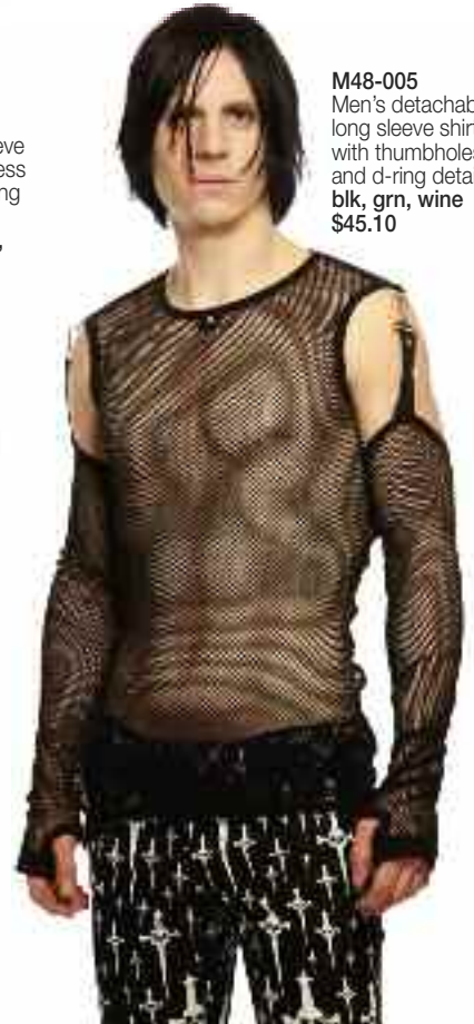
M48-005 Men's detachable long sleeve shirt with thumbholes and d-ring details! blk, grn, wine $45.10