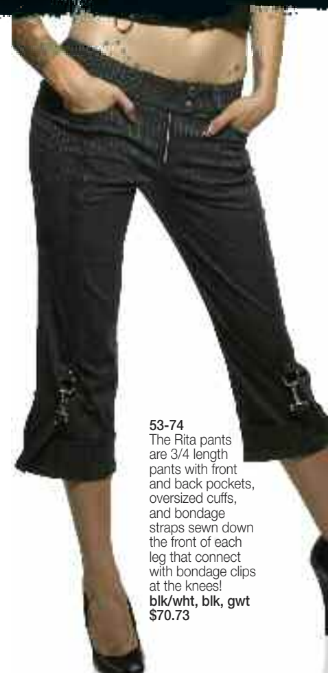
53-74 The Rita pants are 3/4 length pants with front and back pockets, oversized cuffs, and bondage straps sewn down the front of each leg that connect with bondage clips at the knees! blk/wht, blk, gwt $70.73