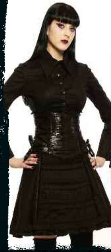
14-139 Waist cincher with ribbon ties and zip back! blk/blk, blood/blk, black $57.40