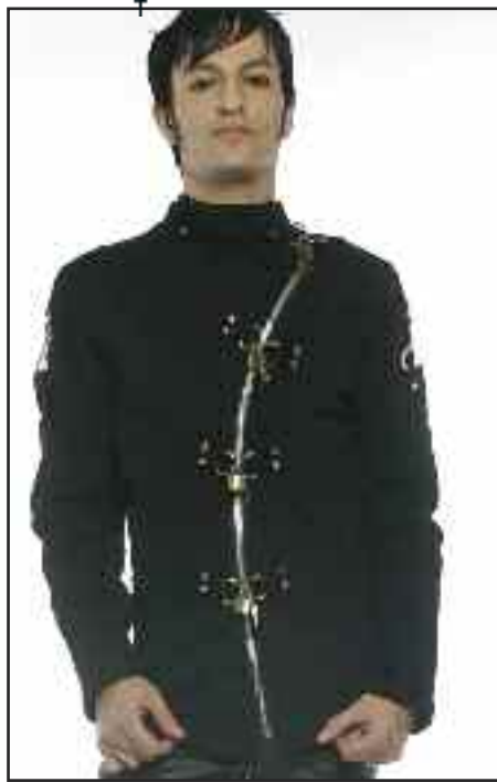
310-G Another Lippy classic! Our stretch f**k'n twill© straight jacket is made of heavy twill with a diagonally curved mondo zipper up the front and real, working padlocks! The sleeves even unfurl to cover your hands and clip behind your back using the d-ring details at the sides! Don't loose the keys, you crazed freak! black, white $123.00