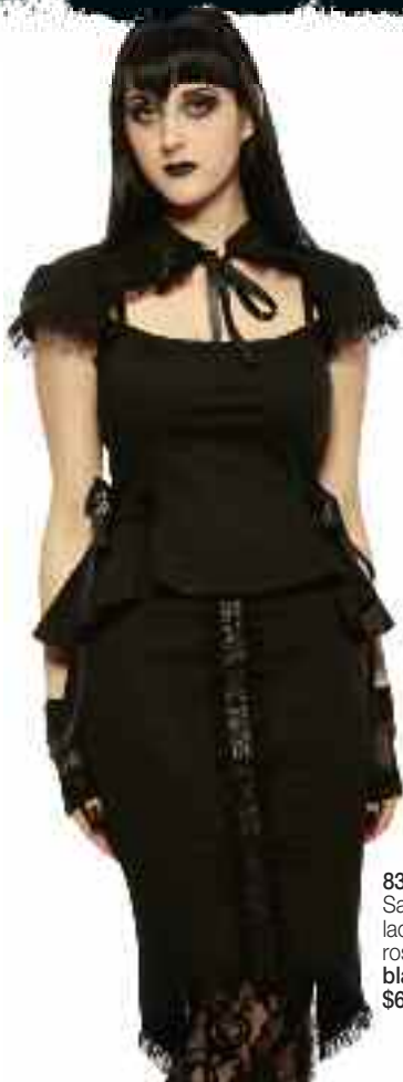
83-170 Sateen skirt with lace trim and rose hardware! black $69.70