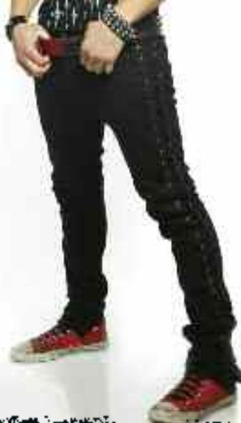
e) M63-115 12 oz Stretch Twill black