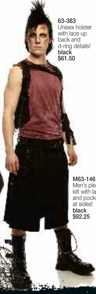
63-383 Unisex holster with lace up back and d-ring details! black $61.50