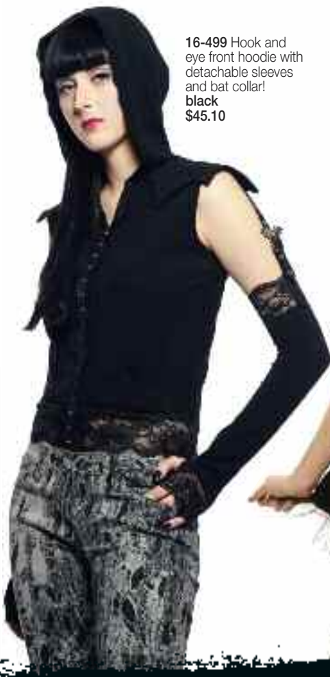
16-499 Hook and eye front hoodie with detachable sleeves and bat collar! black $45.10