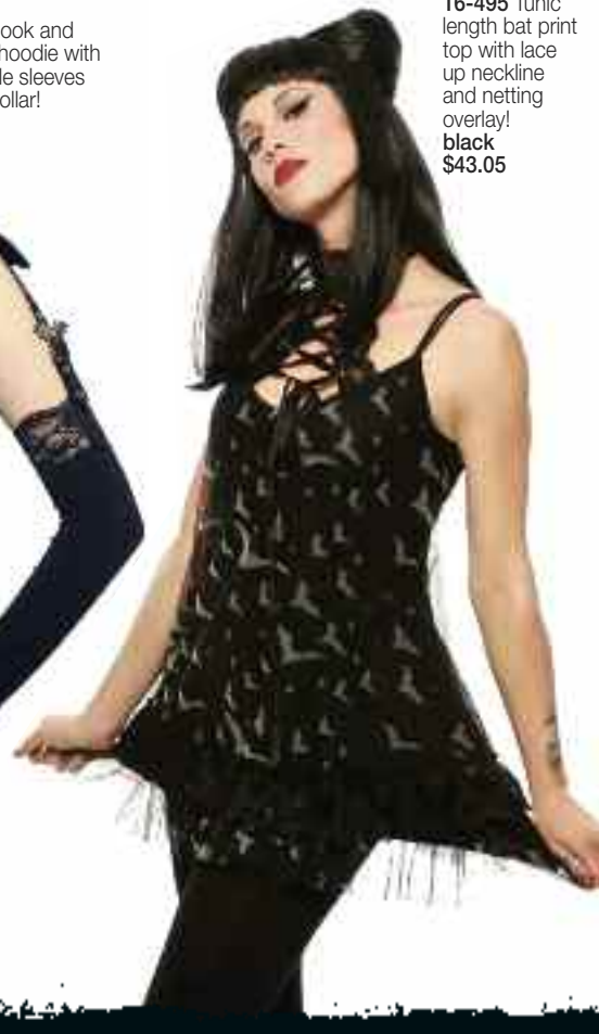
16-495 Tunic length bat print top with lace up neckline and netting overlay! black $43.05