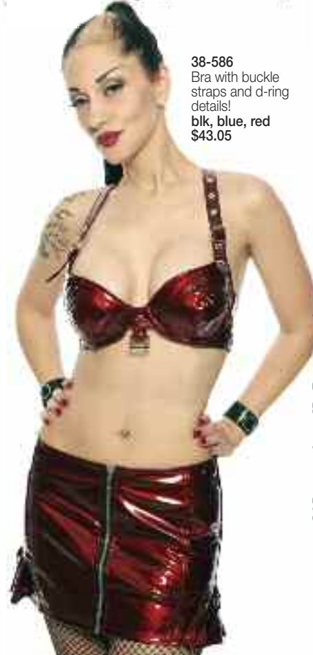
38-586 Bra with buckle straps and d-ring details! blk, blue, red $43.05