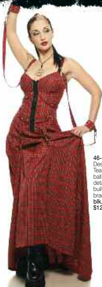
46-538 Destructive Tease zip front ball gown with detachable built-in spiked bracelet cuffs! blk, mag, red $120.95