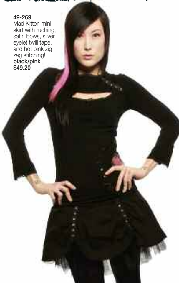
49-269 Mad Kitten mini skirt with ruching, satin bows, silver eyelet twill tape, and hot pink zig zag stitching! black/pink $49.20