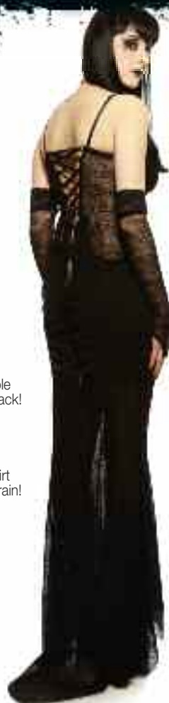
26-118 Web Princess long skirt with lace up back and train! black $73.80