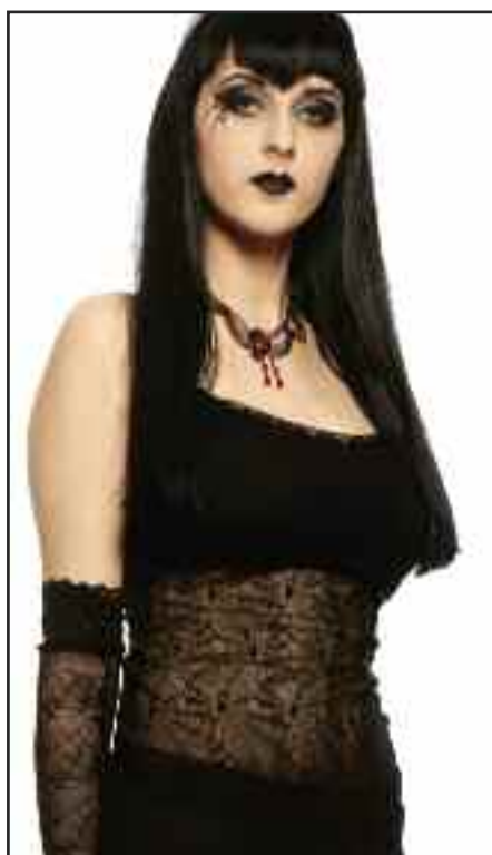
26-117 Witching Hour camisole with bow and lace up back! black $38.95