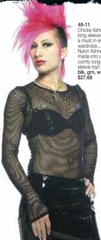
48-11 Chicks fishnet long sleeve top - a must in every wardrobe... Nylon fishnet made into a comfy long- sleeve top! blk, grn, wine $27.68