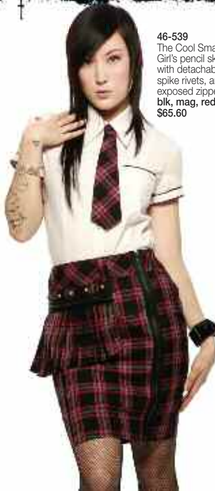
46-539 The Cool Smart Girl's pencil skirt with detachable kilt, spike rivets, and exposed zipper! blk, mag, red $65.60