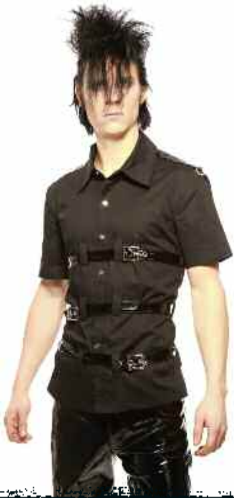
M49-029 Men's button up work shirt with vinyl strap details! black, red, blue $73.80