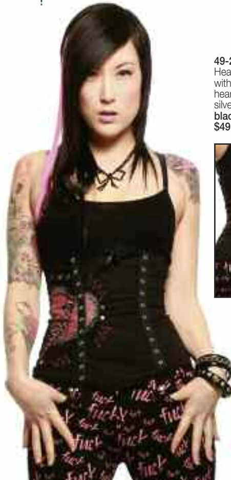
49-268 Heart Broken waist cincher with boning at seams, broken heart patch, satin bows, and silver eyelet twill tape trim! black/pink $49.20

For you softies who wear your broken hearts like badges on your sleeves! Only you can make love's torture so cute and so sweet. Fake fur trim around the hood.