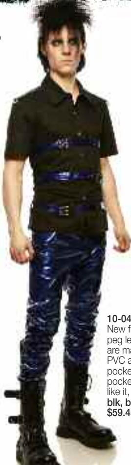
10-04-G New fit - Our classics peg legged vinyl jeans are made entirely of PVC and have two front pockets and two back pockets, just how you like it, 35" inseam! blk, blue, red $59.45