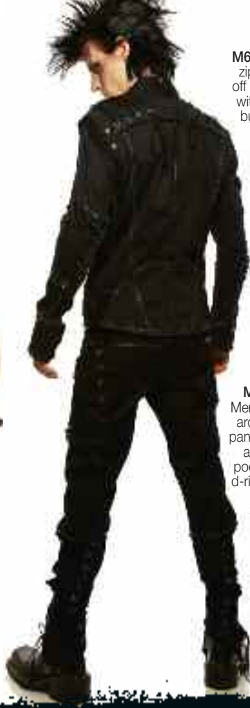
M63-145 Men's zip front snap off sleeve jacket with spike and buckle detail! black $120.95