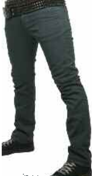
d) M63-001 10.5 oz Stretch Twill black