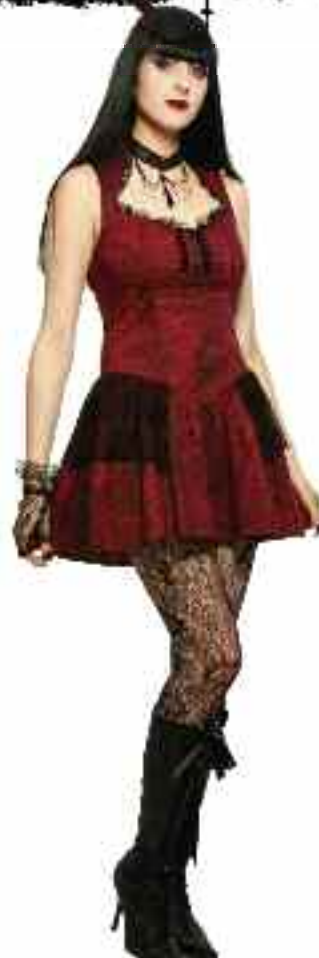
14-141 Printed stretch poplin dress with faux buttons and lace contrast! blk/blk, blood/blk, black $92.25