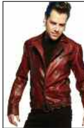
M27-010 Men's moto jacket with zips and buckle strap at waist! grey, red $131.20