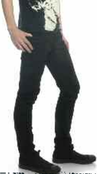
c) 301-G 10.5 oz Stretch Twill black