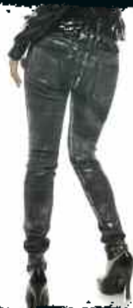
r) 63-335 10.5 oz Stretch Twill red, silver